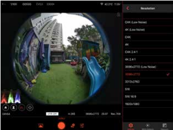
Screenshot of the Z Camera app on iPad

Set your preferred shooting parameters to the stereo pair Press the shutter on master cam to start/stop recording