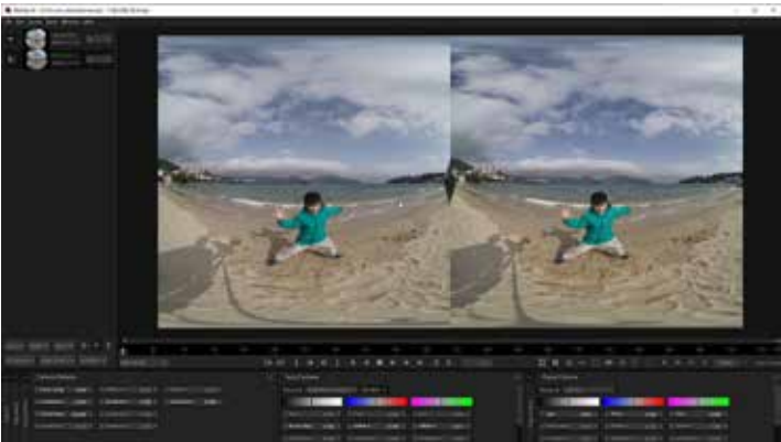
MistikaVR license not included

Post Processing with MistikaVR using Preset for unwrapping fisheye, aligning for stereo and much more